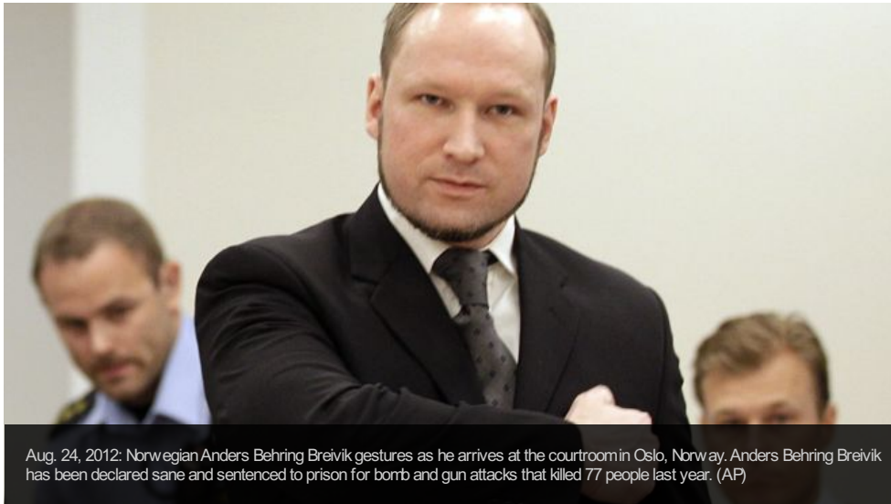
Aug. 24, 2012: Norwegian Anders Behring Breivik gestures as he arrives at the courtroom in Oslo, Norway. Anders Behring Breivik has been declared sane and sentenced to prison for bomb and gun attacks that killed 77 people last year.

Published September 07, 2012 Associated Press